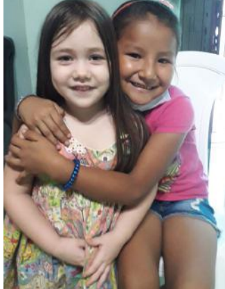
And this is a small slice of the work of the Lord in their ministry in 2022. Praise God for His goodness and grace to this ministry and thank you for your support and prayers.